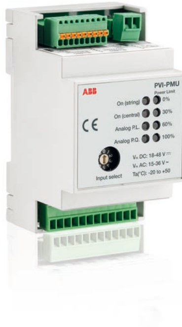
ABB monitoring and communications PVI-PMU